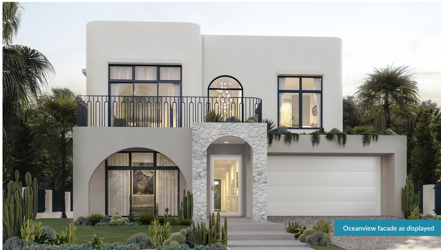
Oceanview facade as displayed