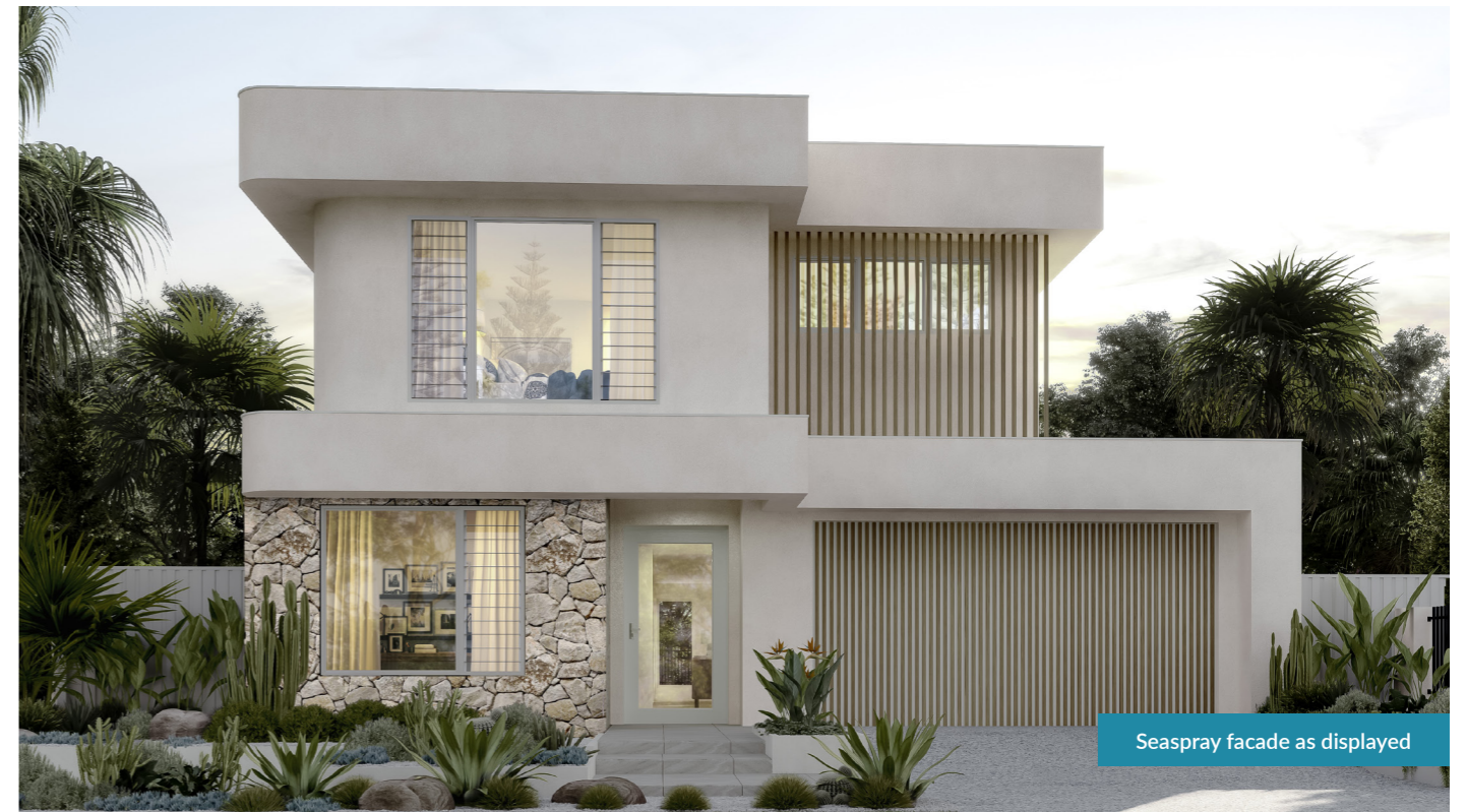
Seaspray facade as displayed